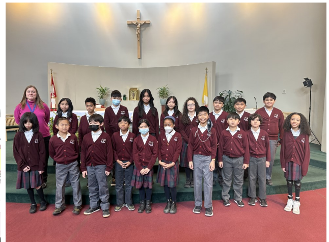
Gr. 5L Class leads our March School Mass