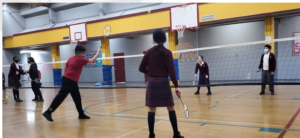
Grade 5's play with new partners in Intramural badminton