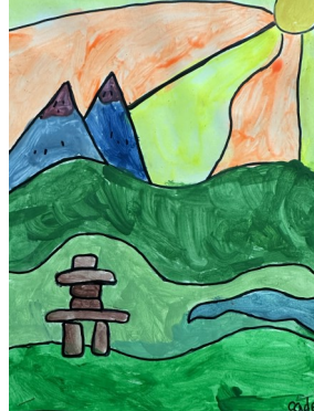
Grade 1 Ted Harrison artwork