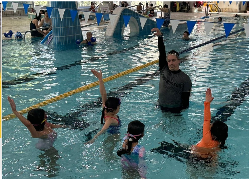
Grade 2's begin the Swim for Life Program from the Lifesaving Society