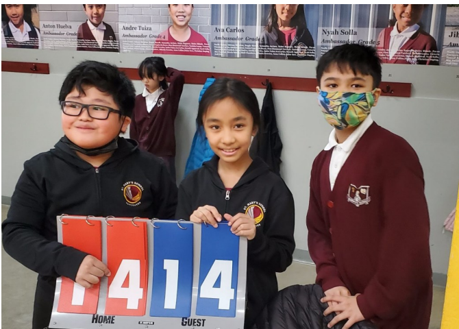
Grade 5's scorekeeping a close Intramural Badminton game