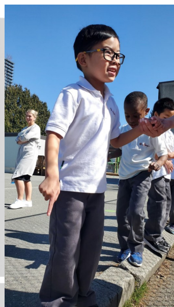
Kindergartens beginning PHE class with a balance challenge