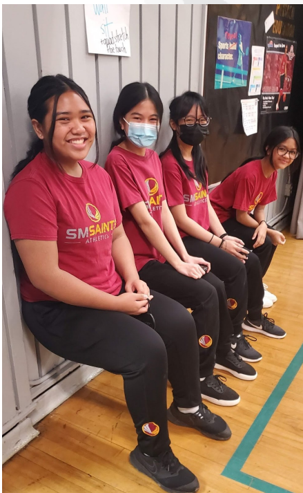
Reaching strength goals with help from our friends