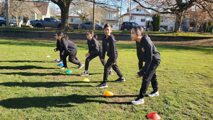
Learning about Lanes in track