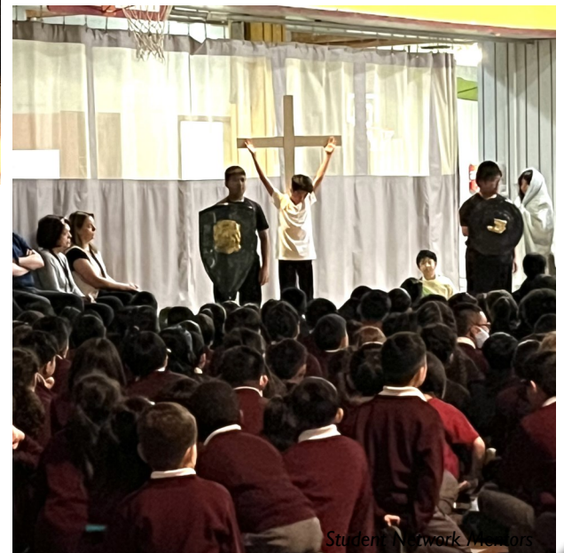
Student Network Members